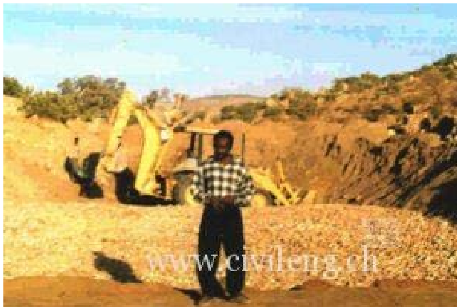
Figure 4 Gravel filter lying, Halhal.