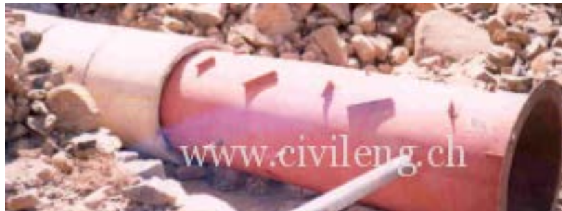
Figure 7 Valve and concrete pipe connector used at Halhal dam.

The external end of the outlet structure, constructed with a metal pipe that connects the valve to the concrete pipe, is shown in Figure 7.