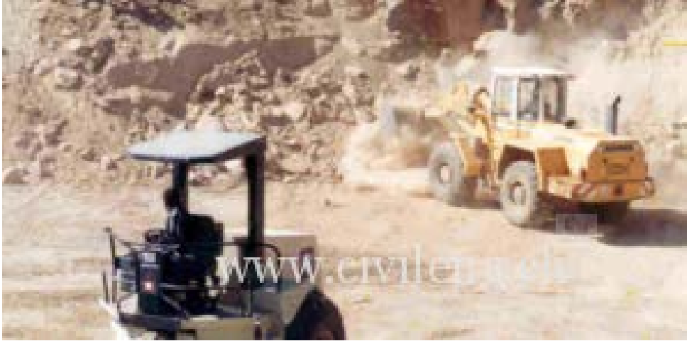
Figure 8 Construction of Halhal earth dam (Dam Mikilim).

The foundation at the central axis of the dam was excavated and filled with clay soil up to the freeboard level. Figure 8 shows the construction process of the dam at Halhal.