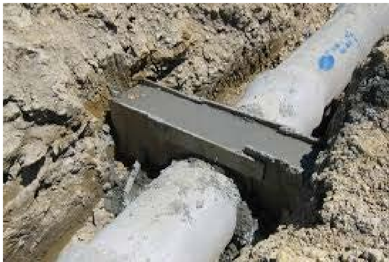
Figure 5 Seepage protection collar.

Figure 5 demonstrates the type of collars used at Halhal dam (image sourced from the internet for illustrative purposes).