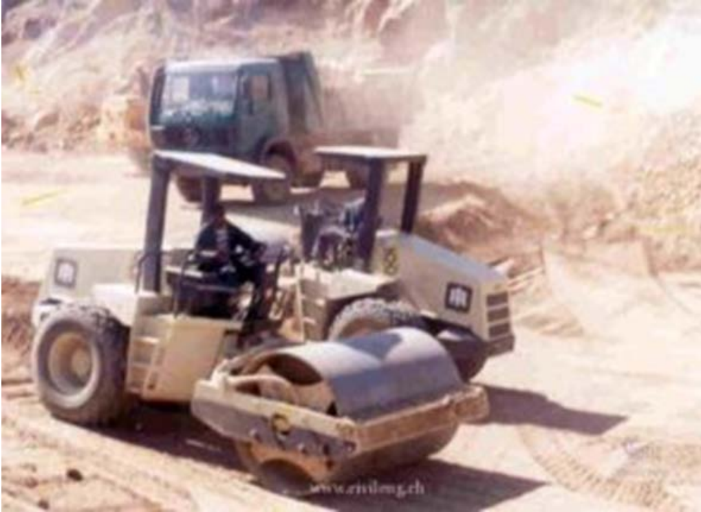
Figure 9 compaction process during the construction of Halhal dam.