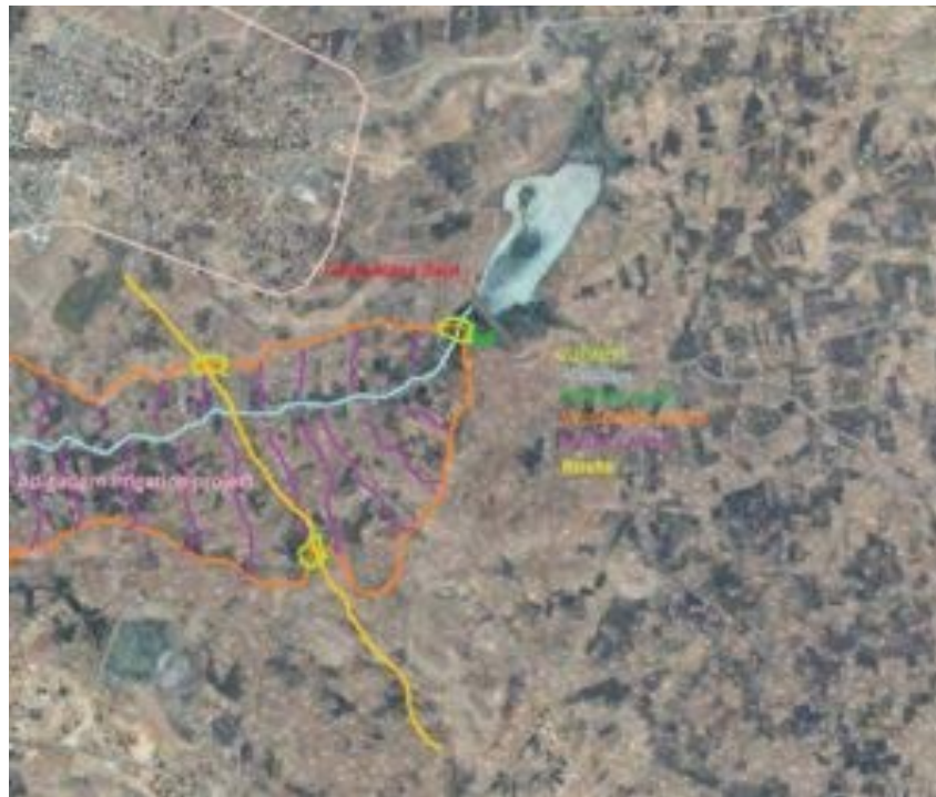
Figure 1 Halhal small-scale earth dam, Mikilim Dam.

Location: Halhal Village, Anseba Region, Eritrea. Figure 1 provides a birds-eye view of the reservoir.