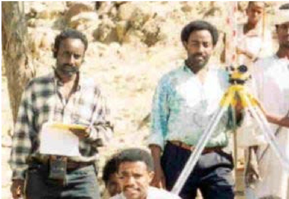
Figure 2 Photo taken at Asmat irrigation project, 1997.

The responsibility of the team was not only to construct the dam but also to monitor and manage various smaller diversion structures in surrounding regions, such as the Asmat area, where a small weir was built to divert floodwater into a basin irrigation system. Figure 2 illustrates the Asmat irrigation project survey.